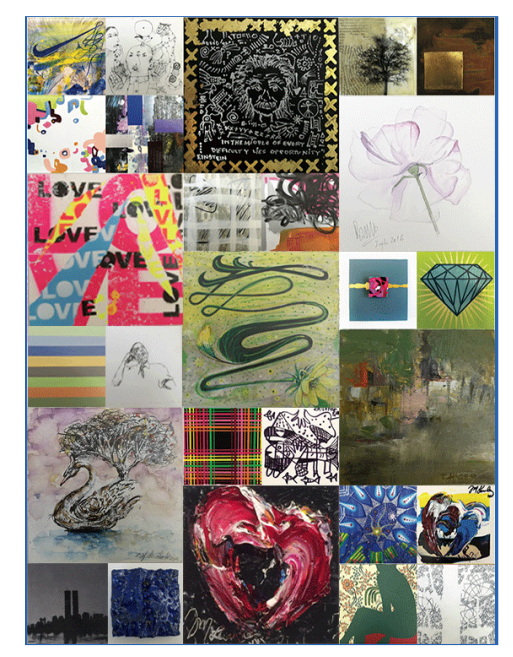
Tiles donated by artists from the Affordable Art Fair NYC 2016 Fall Edition

Our 5th Anniversary Celebration in October was a great evening! We were proud to recognize the achievements of ATOC's earliest days, and reveal our new name and logo to 200 friends and supporters. Highlights of the evening included remarks from a client who spoke to the safe environment and camaraderie she receives from us and a breath-taking client art exhibit. The Silent Auction and record-breaking Paddle Raise, combined with ticket sales and other contributions, raised $90,000 for The Art Therapy Project.